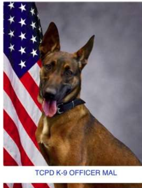
TCPD K-9 OFFICER MAL